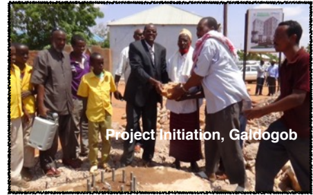
Tawakal Plaza, Garowe.

Similarly, a third building is underway in Galdogob - 'Tawakal Plaza Galdogob' comprising a four story building consisting of: